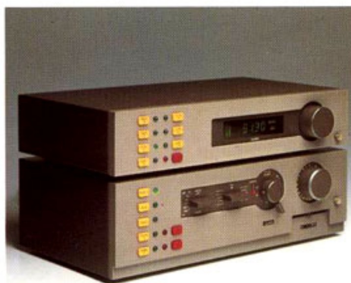
The Quad FM4 with the Quad 44 control unit.